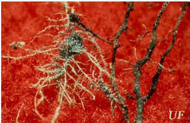
Figure 2. Compared with the healthy St. Augustinegrass roots on the left, the lance nematode-damaged roots on the right appear dark and are missing small feeder roots.

Damage may show up as patches of yellowing, dying or unthrifty grass, not unlike that caused by chinch bugs or some fungal pathogens. These symptoms also can be caused by drought or nutrient deficiency. Examination of the roots of a lance nematode-infested lawn often will reveal thorough damage to the root system. Small feeder roots are gone, and root tips appear dead. If new roots have begun to grow, they usually are injured as well. It is this damage to the root system that is responsible for the yellow or dying patches of grass.