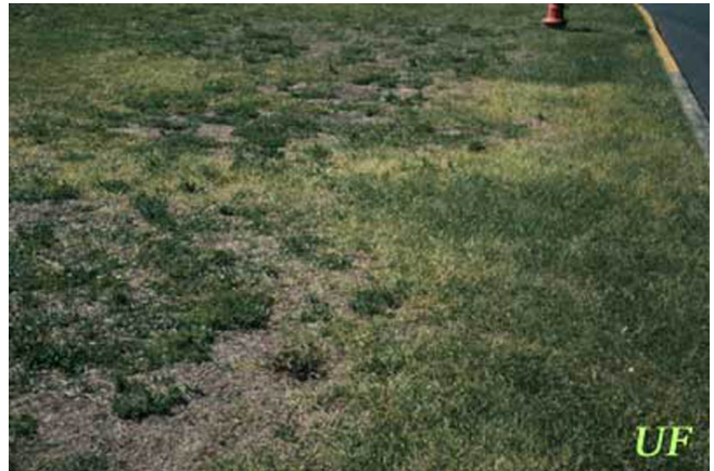
Figure 3. Patches of yellowing, dying or unthrifty grass are often typical of lance nematode damage, seen here in St. Augustinegrass.

H. galeatus may attach itself to the roots by embedding its anterior end, or sometimes its entire body, inside. As it feeds, it destroys the root system,