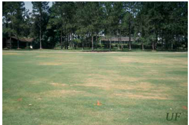
Figure 4. This Bermudagrass shows typical signs of damage from the lance nematode, the most common nematode pest on Bermudagrass putting greens in Florida.

causing outer layers of the dead roots to slough away. This kind of damage is often a sign of lance nematode infestation but may also be caused by fungal root rot.