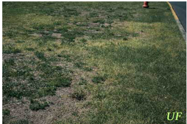
Figure 3. Patches of yellowing, dying or unthrifty grass are often typical of lance nematode damage, seen here in St. Augustinegrass.

H. galeatus may attach itself to the roots by embedding its anterior end, or sometimes its entire body, inside. As it feeds, it destroys the root system,