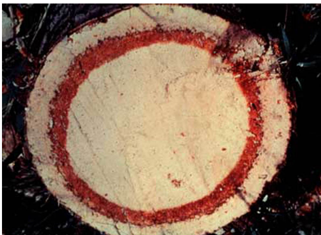
Figure 1. The telltale red ring seen here in a cross-section of a palm indicates that this particular tree is infested by red ring nematode, Bursaphelenchus cocophilus .

The major internal symptom of red ring infection is the telltale red ring (Figure 1) for which the disease was named. A crosswise cut through the trunk of an infected palm one to seven feet above the soil line usually will reveal a circular, colored band approximately 3 to 5 cm wide, variable with the size of the tree. The surface of the cut in a healthy tree appears a solid, creamy white. The most common color of the band is bright red, although the shade can vary from light pink or cream to dark brown in infected African oil palms.