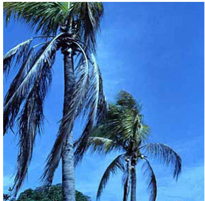
Figure 2. Smaller-than-usual and dying leaves are one of the symptoms of red ring disease, caused by the red ring nematode Bursaphelenchus cocophilus .

In some African oil palms and older coconut palms, infected trees begin to produce small, deformed leaves that retain their green color and are not initially necrotic. This is a sign of little leaf disease, a chronic disease that can lead to red ring disease. New leaves often get shorter as the disease progresses, causing the central crown of the tree to resemble a funnel (Figure 2). Eventually, these new "little leaves" display varying degrees of necrosis. These trees often stop producing fruit. This symptom is not as common in coconut palm as it is in African oil palm (Chinchilla 1991, Giblin-Davis 2001).