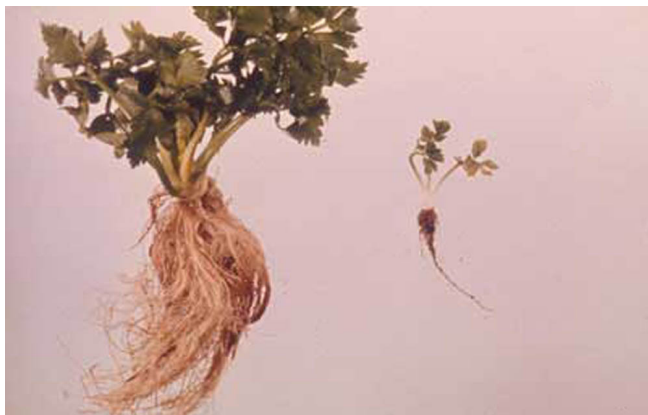
Figure 2. Awl nematodes ( Dolichodorus spp.) cause severe stunting, which can be seen in the celery plant on the right. The plant on the left is unaffected.

The damage caused by awl nematodes leads to severe stunting of the entire plant because of depletion of the root system. The roots are often coarse with stubby tips. The few secondary roots that remain are stubby as well.