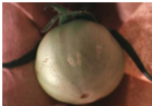
Figure 5. Dimpling resulting from thrips egg-laying

The western flower thrips lays eggs in the small fruits in the flower. Eggs are laid individually resulting in a small dimple sometimes surrounded by a white halo on mature fruit. For fruits such as tomato, this dimpling can result in the culling of individual fruits or even downgrading of the crop (Figure 5).