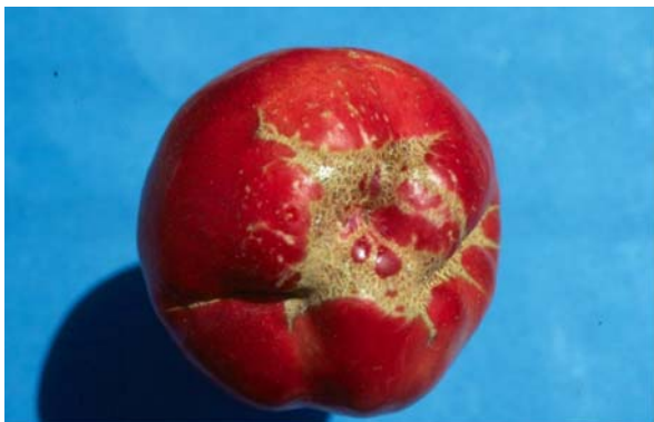
Figure 2. Deformity on nectarine from thrips feeding

Thrips induce a range of symptoms in plant tissue by their feeding (Childers 1997). On small fruits, feeding results in deformity (Figure 2).