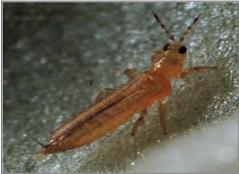
Figure 1. An adult flower thrips (actual length about 1/10 inch). Photo: Cheryle O'Donnell Credits:

There are about 5,000 described species of thrips (insects in the Order Thysanoptera) (Moritz et al. 2001; Mound 1997). Most feed on fungi and live in leaf litter or on dead wood. The species that feed on higher plants occur mostly in the Family Thripidae (Figure 1). This family includes the important pest species. Some reproduce in flowers and feed on the cells of the flower tissues, on pollen grains, and on small developing fruits. Many of the flower-living species are partly predatory. Other species primarily feed on leaves. Some species are predators on small insects. Some of the most common pest species feed on a wide range of plants and even prey on mites.