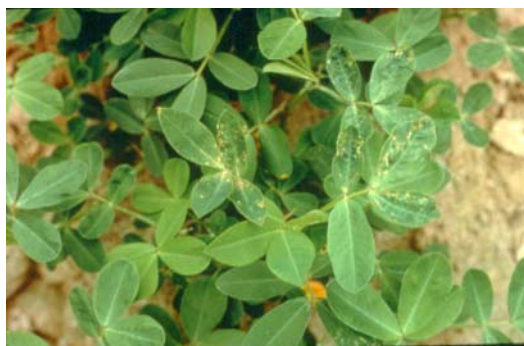
Figure 3. Deformity on peanut leaves from thrips feeding

Some species cause similar damage to leaves (Figure 3).