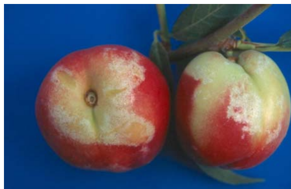
Figure 4. Scarring and corky tissue on nectarines resulting from thrips feeding

Silvering is common, due to air entering cells from which the contents have been removed, and on fruits this leads to scarring and corky tissue development (Figure 4).