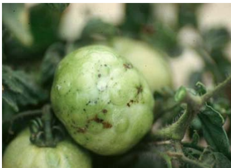
Figure 7. Symptoms on tomato infected by tomato spotted wilt virus. Credits:

The tomato spotted wilt virus has a worldwide distribution, with a host range of over 926 species (Figure 7). Most susceptible plant species belong either to the Compositae family, of which 213 species are susceptible, or the Solanaceae family, of which 168 species are susceptible. More detailed information on the biological and molecular aspects of the tomato spotted wilt virus, including a list of host plants, can be found at the website address, http://www.dpw.wageningen-ur.nl/viro/research/tospo.html .