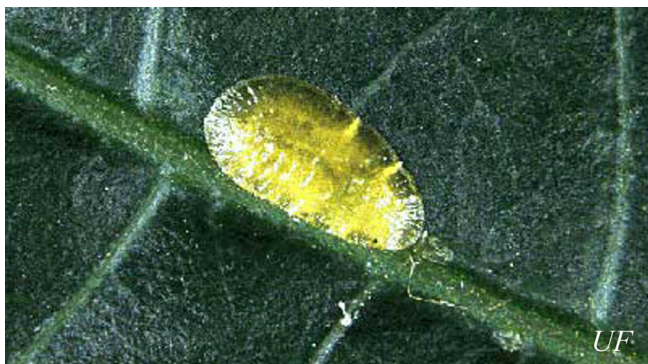
Figure 1. Adult female green scale, Coccus viridis (Green).