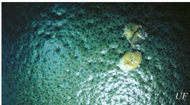
Figure 4. Green scale, Coccus viridis (Green), on green citrus fruit.

Accumulations of sooty mold cause the infested plant to be unsightly.