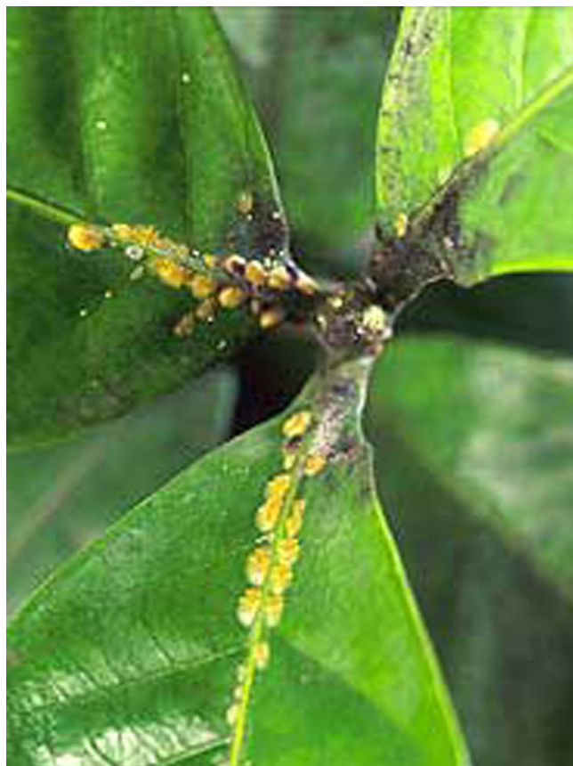
Figure 2. Infestation of green scale, Coccus viridis (Green), showing the typical arrangement in a line along the mid-rib and lateral views.

The green scale has a wide host range consisting of vegetable, fruit and ornamental crops (Mau and Kessing 2006). The preferred host for green scale in Florida is groundsel bush, Baccharis halimifolia L., a non-cultivated plant. Preferred cultivated hosts are gardenia and ixora. The Division of Plant Industry