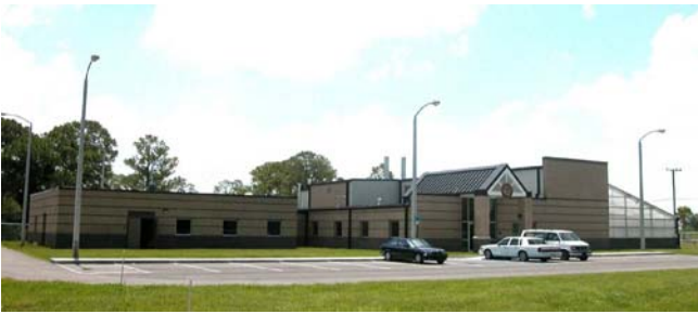
Figure 3. The UF-IFAS/DOACS-DPI biological control research and containment laboratory in Fort Pierce.