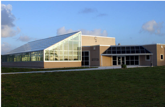
Figure 2. The USDA/ARS biological control containment laboratory in Fort Lauderdale.

conducting classical biological control research and implementation in Florida.