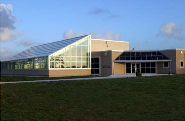
Figure 2. The USDA/ARS biological control containment laboratory in Fort Lauderdale.

conducting classical biological control research and implementation in Florida.