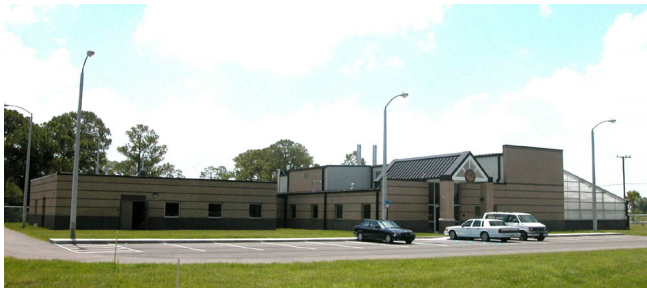
Figure 3. The UF-IFAS/DOACS-DPI biological control research and containment laboratory in Fort Pierce.