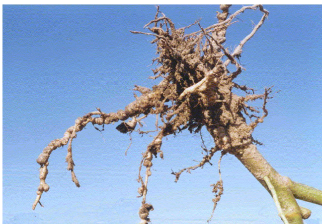
Figure 2. Root galling.