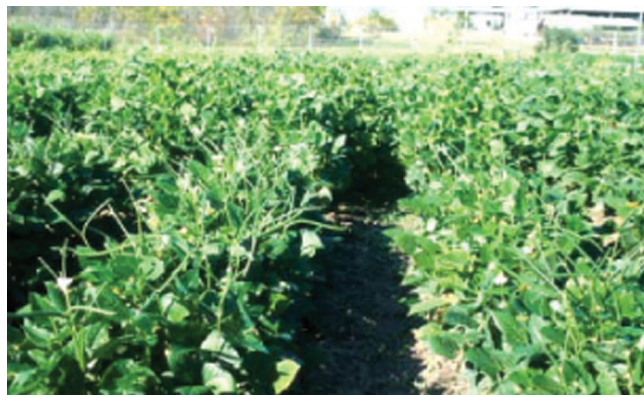
Figure 1. Cowpea planted as a cover crop.

Florida (McSorley and Gallaher, 1991), resulting in severe root galling (Figure 2). When nematodes build up on cowpea or other cover crops, they can cause damage and yield loss to the next crop planted, which could be a valuable cash crop. Fortunately, some cultivars commonly cultivated have various degrees of resistance to one or more species and races of root-knot nematodes (Table 1, Gallaher and McSorley, 1993). This combination of nematode and nitrogen management could be especially useful in organic production systems where neither nematicides nor synthetic nitrogen fertilizers could be used.