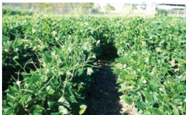
Figure 1. Cowpea planted as a cover crop.

severe root galling (Figure 2). When nematodes build up on cowpea or other cover crops, they can cause damage and yield loss to the next crop planted, which could be a valuable cash crop. Fortunately, some cultivars commonly cultivated have various degrees of resistance to one or more species and races of root-knot nematodes (Table 1, Gallaher and McSorley, 1993). This combination of nematode and nitrogen management could be especially useful in organic production systems where neither nematicides nor synthetic nitrogen fertilizers could be used.