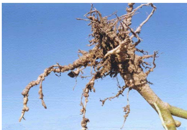
Figure 2. Root galling.