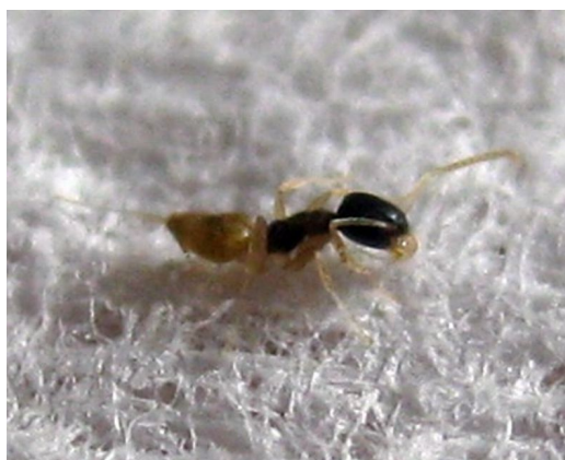
Figure 1. Worker of the ghost ant, Tapinoma melanocephalum (Fabricius), lateral view.

The ghost ant, Tapinoma melanocephalum (Fabricius), was considered a nuisance ant that was occasionally important as a house pest within Florida as late as 1988. Field populations were confined to South Florida although active colonies had been reported as far north as Gainesville, in Alachua County (Bloomcamp and Bieman, personal communication) and Duval County, (Mattis et al. 2004). But by 1995, if not before, the ghost ant was common in central and southern Florida and had been elevated to major pest status (Klotz et al. 1995). In more northerly states, infestations are confined to greenhouses or other buildings that provide conditions necessary for survival, as the ant is a tropical species either of African or Oriental origin (Wheeler 1910). However, this introduced ant species is so widely distributed by commerce that it is impossible to determine its original home (Smith 1965).