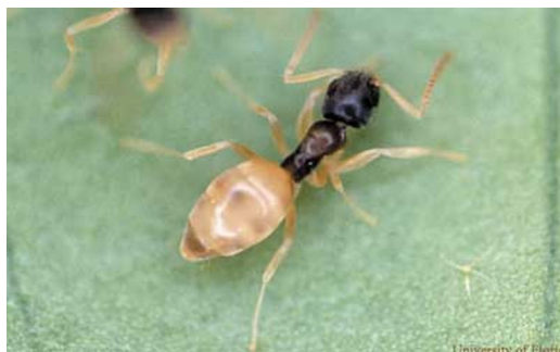
Figure 3. Worker of the ghost ant, Tapinoma melanocephalum (Fabricius), dorsal—lateral view.

dorsally by the gaster (Creighton 1950). Stingers are absent.