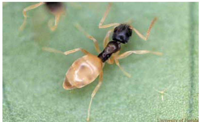
Figure 1. Ghost ant worker, Tapinoma melanocephalum (Fabricius).

The ghost ant is associated with a complex of ant species known as "tramp ants" that is widely distributed in tropical and subtropical latitudes