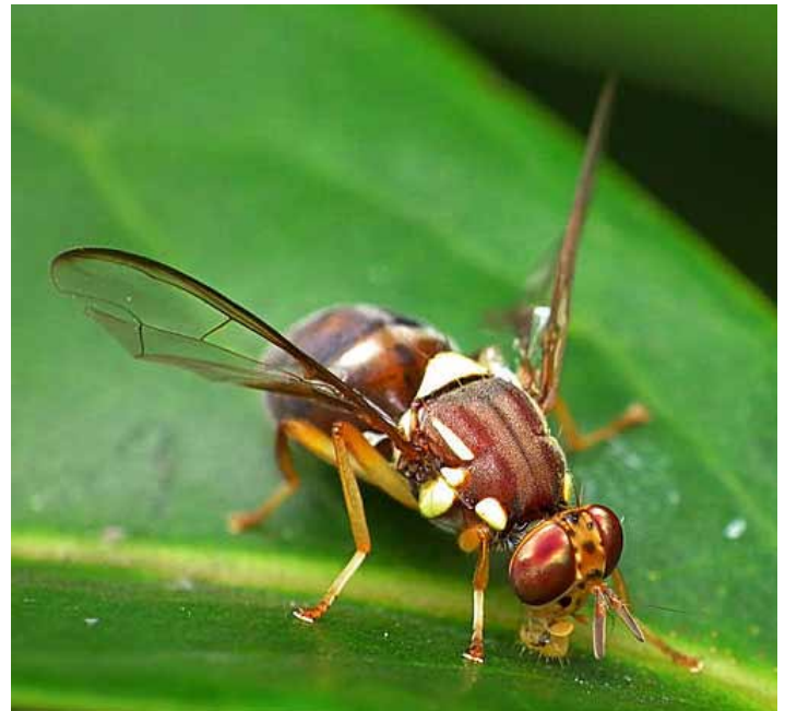
Figure 3. Adult Queensland fruit fly, Bactrocera tryoni (Froggatt).