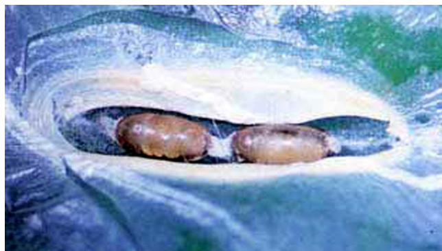
Figure 3. Pupal cell in leaf with two to four Ageniaspis citricola Logvinovskaya pupae.

Ageniaspis citricola is a host-specific, koinobiont, endoparasitoid of citrus leafminer eggs and early instar larvae. All stages of the parasitoid develop within the citrus leafminer host. After being