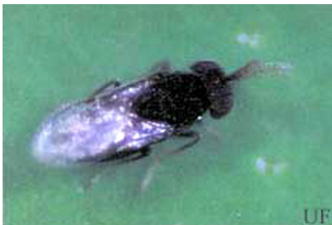
Figure 2. Adult female of Ageniaspis citricola Logvinovskaya.

Ageniaspis citricola is approximately 0.7 to 0.8 mm long. The abdomen of the female is small and triangular, and the thorax is considerably longer than the abdomen. Both males and females are black in color, with fine silvery white pubescence, and with tarsi and portions of the tibiae colored yellow. Antennae are clubbed, 7-segmented and yellowish-brown in color, with a darker scape and pedicel.