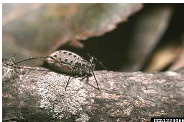
Figure 1. Nearly mature nymph of the giant bark aphid, Longistigma caryae (Harris).

L. caryae has been reported from Alabama, Arkansas, Arizona, California, Connecticut, Delaware, District of Columbia, Florida, Georgia, Illinois, Indiana, Iowa, Kansas, Kentucky, Louisiana, Maryland, Massachusetts, Michigan, Minnesota, Mississippi, Missouri, Nebraska, New Jersey, New Mexico, New York, North Carolina, Ohio, Pennsylvania, South Carolina, Tennessee, Texas, Utah, Virginia, and Wisconsin.