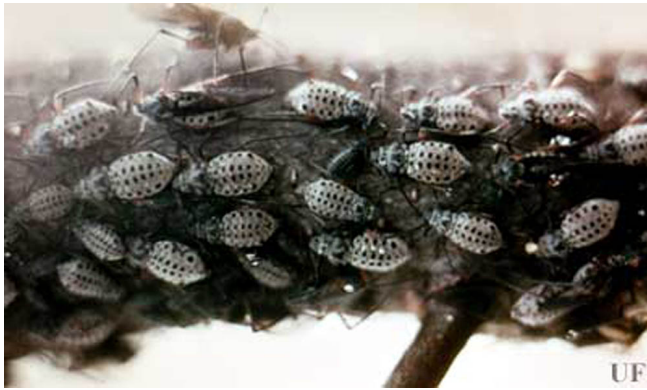
Figure 2. Colony of giant bark aphids, Longistigma caryae (Harris), with both winged and wingless females.

long, light brown hairs. Antennal segment III equal to IV plus V; VI short, with unguis thumb-shaped.