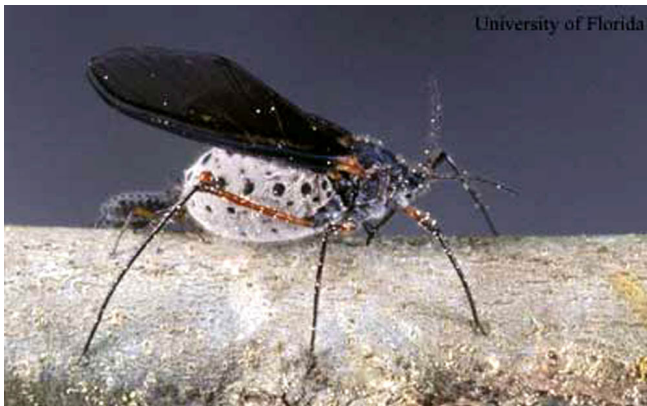
Figure 3. Winged adult giant bark aphid, Longistigma caryae (Harris).

Alate (winged) viviparous female: body 6 mm long, abdomen 3 to 5 mm in diameter, head to tip of folded wings 10 mm; wing expanse 18 mm, antennae 3 mm, posterior legs 11 mm. Head and thorax bluish black, antennae and cornicles black, dorsum of abdomen whitish with 2 rows of black spots on each side of the median line and a transverse series of small, black dots on each segment. Cornicles short and truncate. Tips of femora, tibia and tarsi black. Body, legs and antennae covered with long brown hairs. Wings dusky, especially toward base. Oviparous females do not differ in appearance from viviparous females.