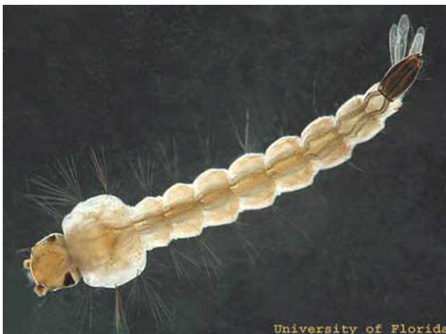
Figure 4. Larva of the Asian tiger mosquito, Aedes albopictus (Skuse).

Development is temperature dependent, but the larvae usually pupate after five to ten days and the pupal stage lasts two days (Hawley 1988). Larvae, also called wigglers, are active feeders. They feed on fine particulate organic matter in the water. The larvae use a breathing siphon to acquire oxygen and must periodically come to the surface to do so. The larvae develop through four instars prior to pupation. Unlike many other insects, the pupae of mosquitoes are active and short-lived. They do not feed but can move about. For more information see the Public Health Pesticide Applicator Training Manual - Mosquitoes, at http://vector.ifas.ufl.edu/chapter_03.htm .