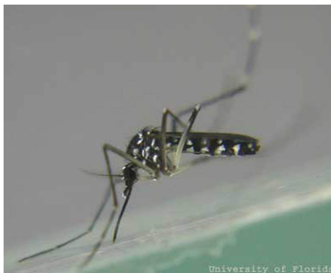
Figure 3. Adult Asian tiger mosquito, Aedes albopictus (Skuse).

http://fme1.ifas.ufl.edu/Key/index.htm .