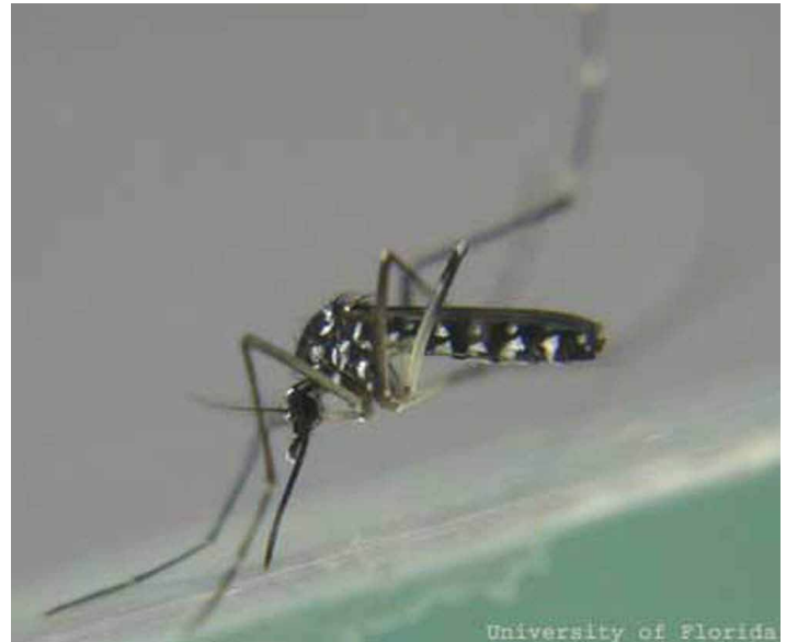
Figure 3. Adult Asian tiger mosquito, Aedes albopictus (Skuse).

Aedes albopictus overwinter in the egg stage in temperate climates (Lyon and Berry 2000) but are active throughout