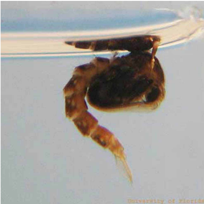
Figure 5. Pupa of the Asian tiger mosquito, Aedes albopictus (Skuse).

mosquito (ABC news 2001) it has not been found to be a significant health concern and is in fact a less efficient vector than other Aedes mosquitoes. Aedes albopictus has been implicated in the transmission of dengue, but this is not a major vector.