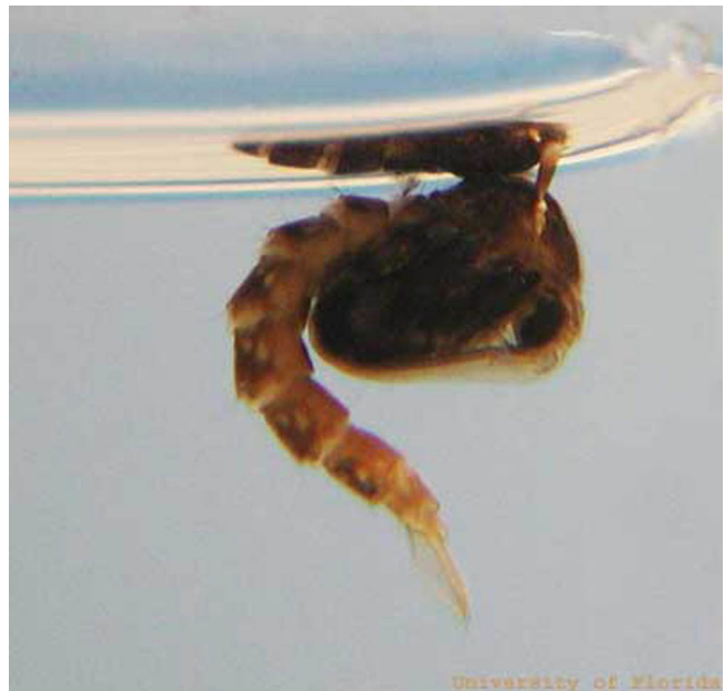
Figure 5. Pupa of the Asian tiger mosquito, Aedes albopictus (Skuse).

Aedes aegypti is the most competent vector of dengue virus (Gulber 1998). The Asian tiger mosquito is considered a maintenance vector and occasionally is involved with dengue transmission in