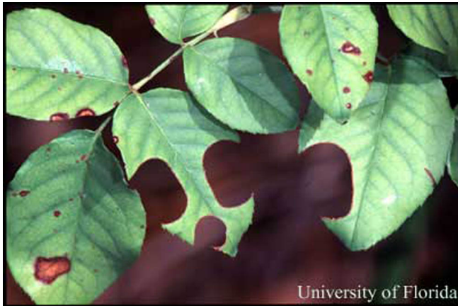
Figure 3. Typical leaf damage caused by leafcutting bees, Megachile spp. The bees use the leaf pieces to construct nests.

contains a ball or loaf of stored pollen and a single egg. Therefore, each cell will produce a single bee. Leafcutting bees construct these nests in soil, in holes (usually made by other insects) in wood, and in plant stems. A diversity of cavities, such as shells of dead snails, holes in concrete walls (like those produced for hurricane shutters) and other holes in man-made objects are used as nesting sites.