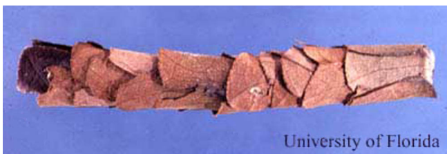
Figure 4. Nest of leafcutting bee pulled out of a cavity such as a hole in wood. This nest contains several cells; each cell will produce one adult leafcutting bee.

Most leafcutter bees overwinter in these nests as newly formed adults. In the following spring these adults chew their way out of the nest. Leafcutters are solitary bees and do not live in large groups or colonies like honey bees. Leafcutters do not aggressively defend nesting areas like honey or bumble bees. Their sting has been described as far less painful than that of a honey bee. Leafcutting bees will only sting if handled and therefore are not a stinging danger to people.