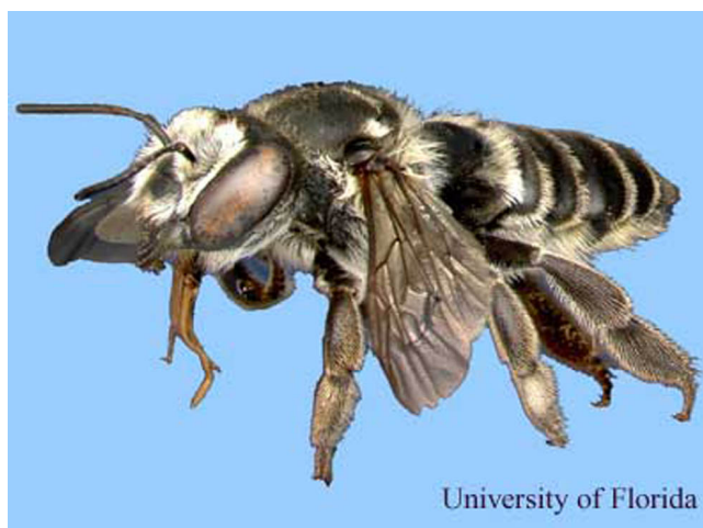
Figure 1. A leafcutting bee, Megachile sp.

Leafcutting bees are mostly moderate-sized (around the size of a honey bee, ranging from 5 mm to 24 mm), stout-bodied, black bees. The females, except the parasitic Coelioxys , carry pollen on hairs