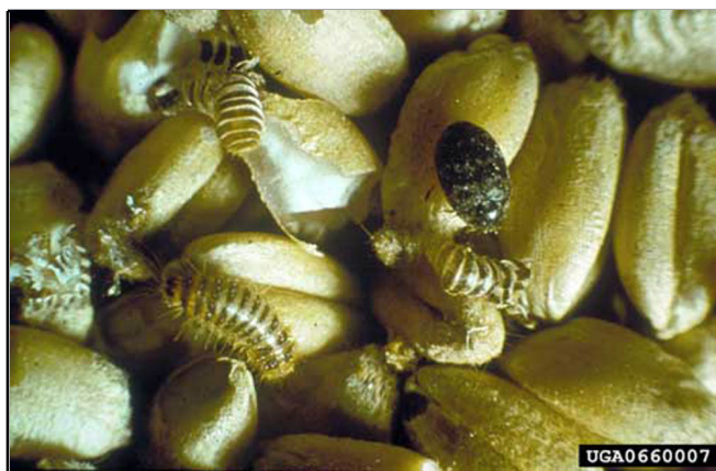
Figure 3. Adult, larva, and larval skins of the khapra beetle, Trogoderma granarium Everts, and the damage caused by the larvae.

Larvae: The larvae at hatching are approximately 1.6 to 1.8 mm long, more than half of this length consisting of a tail made up of hairs on the last abdominal segment. Larvae are uniformly yellowish white, except head and body hairs are brown. As the larvae increase in size, their body color changes to a golden or reddish brown, more body hairs develop, and the tail becomes proportionally shorter. Mature larvae are approximately 6 mm long and 1.5 mm wide.