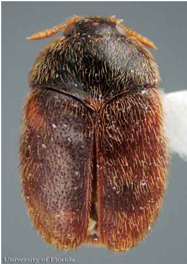
Figure 1. Adult khapra beetle, Trogoderma granarium Everts.

species is not found in Australia (intercepted only) and New Zealand (formerly present, but eradicated).