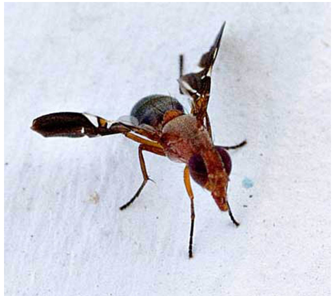
Figure 1. Adult Delphinia picta (Fabricius), a picture-winged fly.

Delphinia thoracica Robineau-Desvoidy 1830