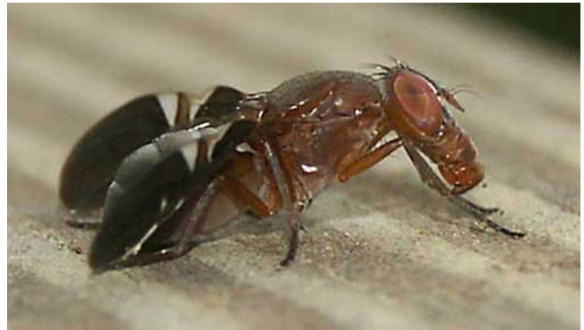
Figure 4. Lateral view of an adult Delphinia picta (Fabricius), a picture-winged fly.

The ovipositor, approximately 1.25 to 1.30 mm in length, is characterized by one ventral and two