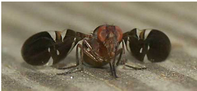
Figure 3. Lateral view of an adult Delphinia picta (Fabricius), a picture-winged fly.

The ovipositor, approximately 1.25 to 1.30 mm in length, is characterized by one ventral and two