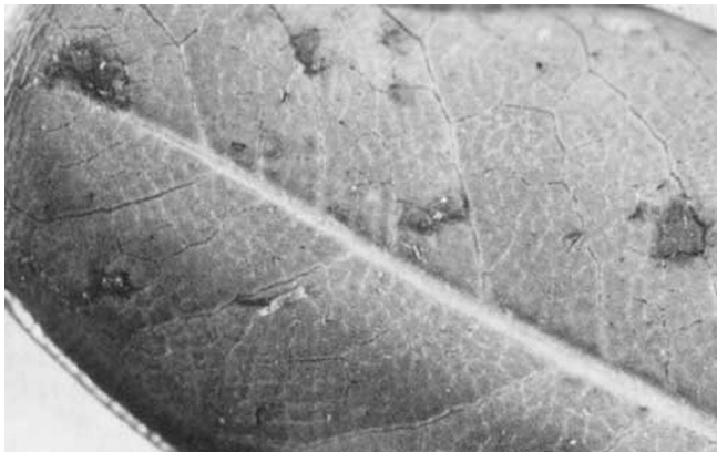
Figure 4. Injury to pittosporum leaf caused by false spider mite, Brevipalpus sp.

Brevipalpus mites inject toxic saliva into fruits, leaves, stems, twigs, and bud tissues of numerous plants including citrus. Feeding injury symptoms on selected plants include: chlorosis, blistering, bronzing, or necrotic areas on leaves (Childers et al. 2003). Injury to Pittosporum sp. is shown below.