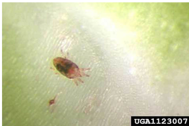
Figure 1. Adult false spider mite, Brevipalpus sp.

Brevipalpus californicus (Banks), sometimes called the "omnivorous mite" in the U.S., has an extensive host range and may cause economic damage, depending on the host. Mites in the family Tenuipalpidae are called false spider mites (they do not spin a web) or flat mites.