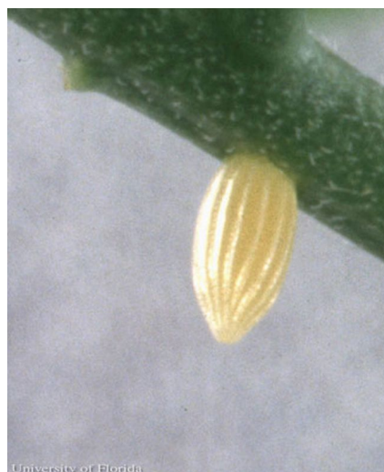
Figure 3. Egg of the checkered white butterfly, Pontia protodice (Boisduval & Leconte).

Pupae: The pupae are bluish-gray with mid-dorsal and lateral white stripes and small black dots on the ventral half of the body. The pupae are attached by a cremaster and a silk girdle