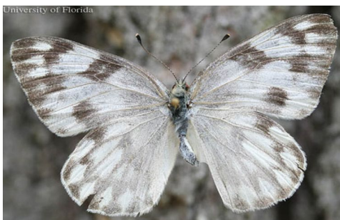
Figure 2. Adult female checkered white butterfly, Pontia protodice (Boisduval & Leconte).

Eggs: Eggs are yellowish when first laid but later change to orange. They are barrel-shaped, tapered at the apex and have longitudinal ridges.