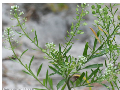
Figure 6. Virginia pepperweed, Lepidium virginicum L., a host of the checkered white butterfly, Pontia protodice (Boisduval & Leconte).

The hosts of checkered white larvae are herbs in the mustard family (Brassicaceae). Preferred hosts are Virginia pepperweed ( Lepidium virginicum L.) in the Southeast and prairie pepperweed ( Lepidium densiflorum Schrad.) in the North, but they also eat the exotic shepherd's purse ( Capsella bursa-pastoris [L.] Medik.) (Miller and Miller 1970).