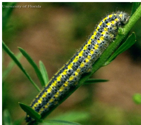
Figure 4. Larva of the checkered white butterfly, Pontia protodice (Boisduval & Leconte).