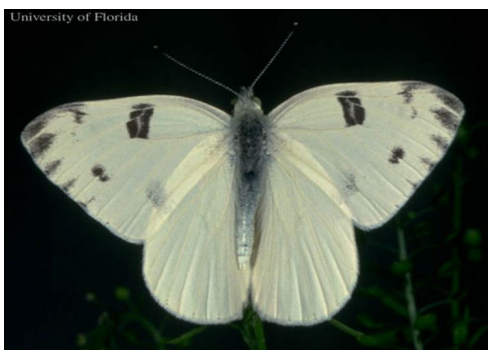
Figure 1. Adult male checkered white butterfly, Pontia protodice (Boisduval & Leconte).

Adults: The wing spread of adults is 1.25 to 2.00 inches (Daniels 2003). Males are white with charcoal markings on the front wings. Females are grayish-white with darker gray or charcoal checkered markings on both front and hind wings. Early spring and late fall (cool season) adults tend to be smaller, darker, and more heavily patterned (Daniels 2003).