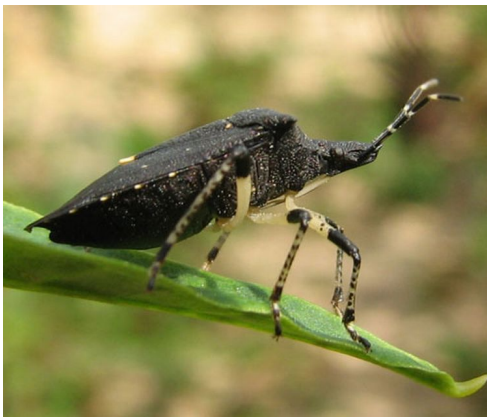
Figure 3. Lateral view of an adult black stink bug, Proxys punctulatus (Palisot).