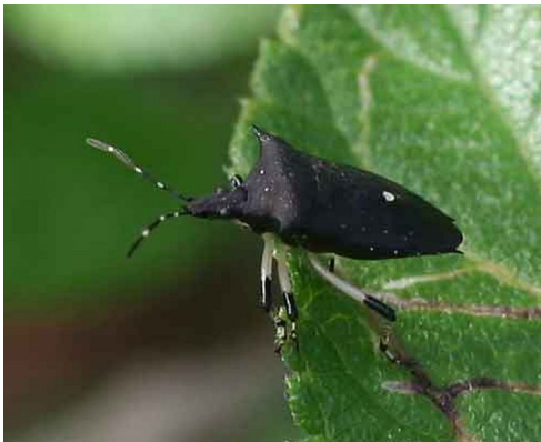
Figure 1. Adult black stink bug, Proxys punctulatus (Palisot), on lantana.

The biology of the black stink bug, Proxys punctulatus (Palisot), is not well known. It has a broad geographical range in the Americas but does not appear to damage agricultural crops as do other more important pentatomids. Black stink bugs appear to be facultative feeders on plants and other insects.