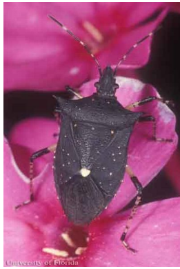
Figure 2. Dorsal view of an adult black stink bug, Proxys punctulatus (Palisot), on phlox.