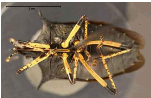
Figure 4. Ventral view of an adult black stink bug, Proxys punctulatus (Palisot).

Eggs: The eggs are usually laid singly and sometimes in pairs, which is a species characteristic. All other North American pentatomids lay their eggs in clusters. The length of the eggs is 1.05mm and their width ~0.96mm. They are white and slightly ovoid.