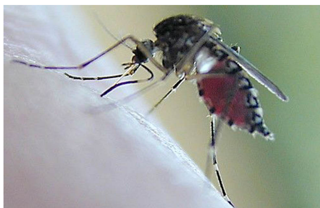
Figure 4. Female Aedes taeniorhynchus taking a blood meal from a human.

Aedes albopictus and Ae. aegypti feed primarily on mammals and are daytime host-seekers so are primarily nuisance species. However, these Aedes species are the primary vectors of CHIKV and DENV in other parts of the world and could play a major role if these viruses emerge in Florida. Aedes taeniorhynchus (Figure 4) and Ae. sollicitans are salt-marsh mosquitoes that are a major nuisance, but have not been implicated as virus vectors because of their limited vector competence for Florida arboviruses. However, these two species are good vectors of VEEV and could be implicated in transmission cycles if this more virulent form of EVEV were to emerge in Florida.