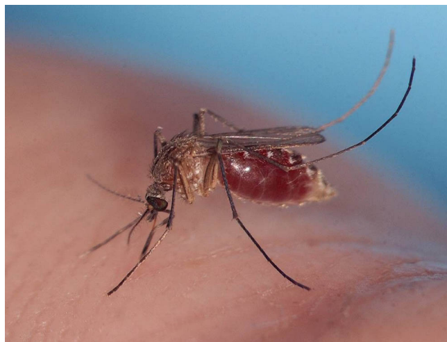
Figure 1. Female Culex pipiens quinquefasciatus taking a blood meal from a human.

mosquito species that do not require blood for egg development, and they can create a batch of eggs from the sugar derived from plant nectar. A female mosquito can lay several batches of eggs during her lifetime, depending on environmental factors affecting her survival rate and availability of blood sources.