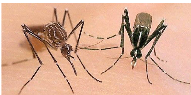
Figure 3. Aedes aegypti and Aedes albopictus .

United States occurred in Florida in the 1930s. However, several dengue cases have been imported into Florida since the 1990s due to infected travelers returning from regions where dengue is endemic. Furthermore, a dengue outbreak occurred in Hawaii from 2001-2002 and Puerto Rico has experienced several epidemics over the last 20 years. Chikungunya virus cases have also occurred in the United States due to infected travelers returning from other countries where chikungunya outbreaks are occurring. Because Florida is home to the primary mosquito vectors of these two viruses, it is possible that DENV and CHIKV will emerge or re-emerge in the United States.