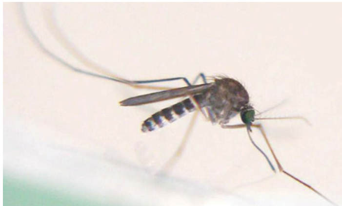
Figure 1. Adult female Culex (Melanoconion) pilosus , a mosquito.

Culex (Melanoconion) pilosus (Dyar and Knab 1906) is a small, dark mosquito that tends to feed on reptiles and amphibians. It is found in the southeastern United States and in many countries in Central America and South America. It has not been identified as a species of medical importance as it has not been shown to vector pathogens like some other Culex species.