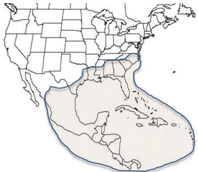
Figure 2. Distribution of Culex pilosus as of March 2012.