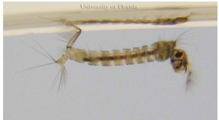
Figure 3. Larva of Culex (Melanoconion) pilosus , a mosquito.

The larvae of Cx. pilosus have a broad head and long antennae with a large tuft at the ends. On the ventral side of the larval head, an oval gill is inserted at the base of the antennae (Carpenter and LaCasse 1955). They have an upcurved siphon and a curved preapical spine at the end of the siphon. There are eight pairs of long tufts of setae on the siphon, comb scales on the eighth abdominal segment in a single row that appear long and pointed, and gills of two different lengths (Cutwa and O'Meara 2012).