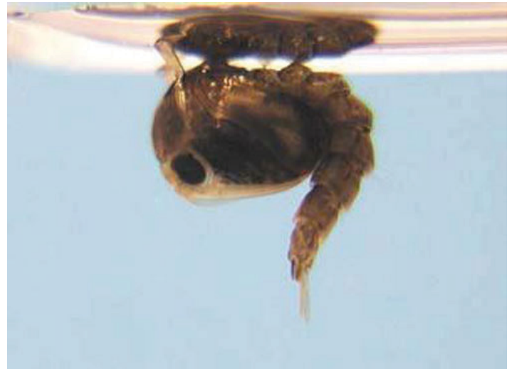
Figure 7. Psorophora ciliata pupa.

The pupae of Psorophora ciliata are very difficult to distinguish from other mosquito pupae and rarely are used for mosquito identification, but the size alone should be an indication of species potential. The pupae of Toxorhynchites species and Psorophora howardii , also relatively large mosquitoes that could be mistaken for Psorophora ciliata .