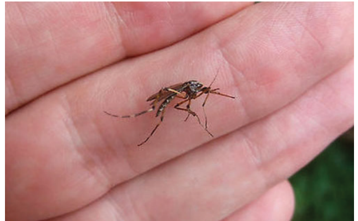
Figure 3. An adult female Psorophora ciliata showing relative size.