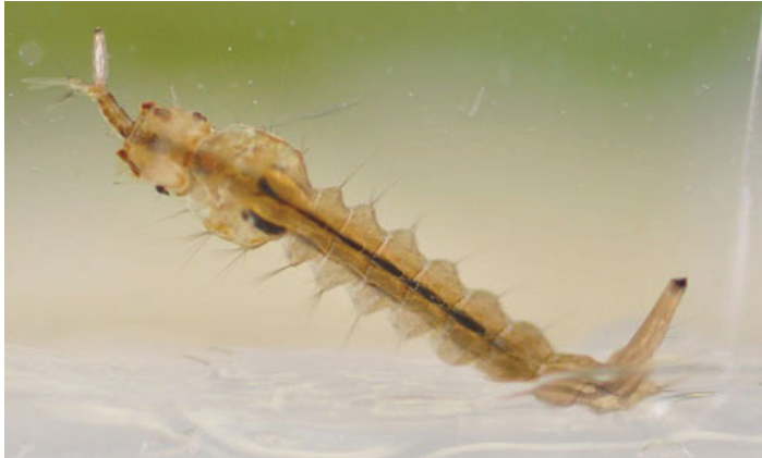
Figure 5. Psorophora ciliata eating a mosquito larva.

Similar to adults, Psorophora ciliata larvae are larger than most mosquito larvae. Another distinguishing characteristic of fourth instar larvae is a square-shaped head with the dorsal side of the head curved inwards (Cutwa and O'Meara 2005; Darsie and Ward 2005). The mouthparts of the larvae have evolved to hold and grasp prey (Shalaby 1957).