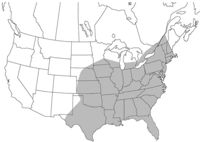
Figure 1. Psorophora ciliata distribution in North America, north of Mexico.

(Campos et al. 2004). A new record has been reported recently from the highlands of Colombia (Barreto et al. 1996) but still east of the Continental Divide. There is no record of Psorophora ciliata in the Old World.