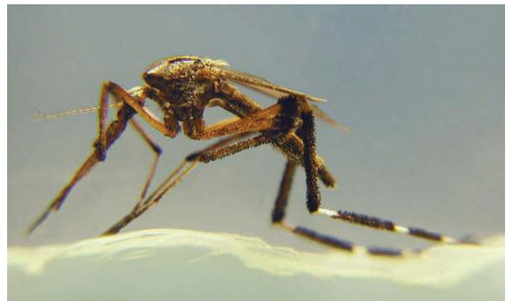
Figure 4. Close-up of a female Psorophora ciliata showing the ‘shaggy’ dark scales.