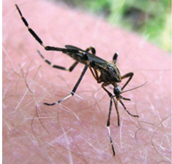
Figure 2. An adult female Psorophora ciliata blood-feeding.

and container-breeding mosquitoes, Psorophora ciliata eggs can stand long periods of desiccation and usually are found in areas where rain collects (Carpenter and LaCasse 1955).