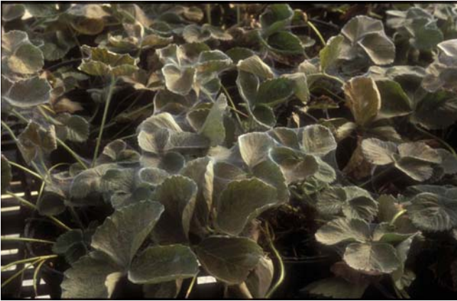
Figure 2. Two-spotted spider mite webbing on strawberries.

pyracantha, orchid, rose and viburnum as well as others. Mite damage is much more severe during dry weather. Large numbers of mites are commonly seen during the spring months, especially April and May, and also again in September and October.