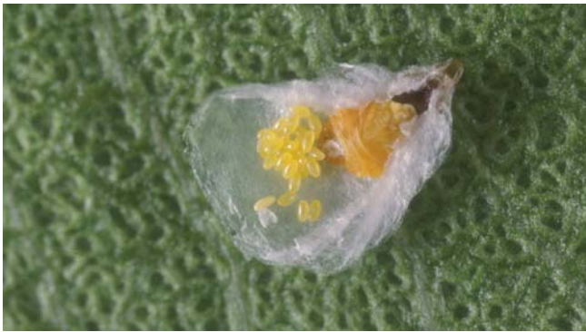
Figure 2. False oleander scale female, turned over to show eggs and female body.