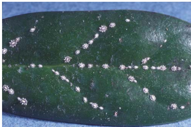
Figure 1. Florida wax scales along leaf veins.

Life cycles of the various scale species differ somewhat, but a generalized life cycle is as follows. The eggs are laid beneath the wax coverings, ovisacs, or beneath the adult female (Figure 2). Eggs generally hatch in 1 to 3 weeks. The newly hatched nymphs (crawlers) move around the plant until they find a suitable feeding site (Figure 3). Wind may also transport crawlers to new hosts. Nymphs insert their straw-like mouthparts into the plant and begin to feed and grow. Males of many species develop wings as adults and fly to locate mates.