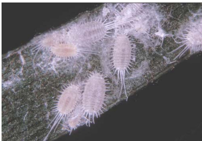
Figure 7. Mealybugs.

the growth of a black fungus called sooty mold (Figure 8). Besides being unattractive, sooty mold interferes with photosynthesis and somewhat slows plant growth. Sooty mold usually weathers away following control of the insect infestation. Ants feed on the honeydew and when ants are observed, plants should be examined closely for these sucking pests.