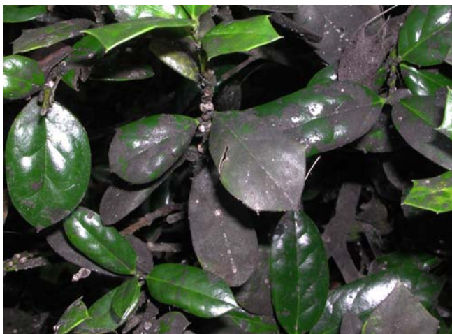
Figure 8. Sooty mold on holly, resulting from a Florida wax scale infestation.

the growth of a black fungus called sooty mold (Figure 8). Besides being unattractive, sooty mold interferes with photosynthesis and somewhat slows plant growth. Sooty mold usually weathers away following control of the insect infestation. Ants feed on the honeydew and when ants are observed, plants should be examined closely for these sucking pests.