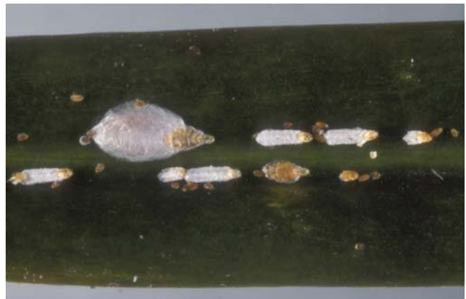
Figure 5. Cycad aulacaspis scale adult female, male covers, and nymphs.

Over 60 species of soft scales occur in Florida. Soft scales (Figure 6) also secrete a waxy covering, but it is attached to their bodies. Soft scales vary widely in color, size, and shape. They range from 1/8