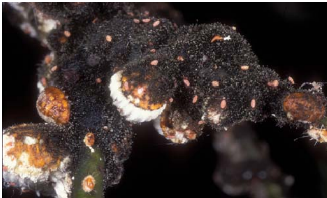
Figure 3. Cottony cushion scale crawlers on sooty mold-covered adults.

and smaller than that of females (Figure 5). After molting, adult males are tiny, winged, gnat-like insects and are rarely seen. Armored scales do not secrete honeydew.