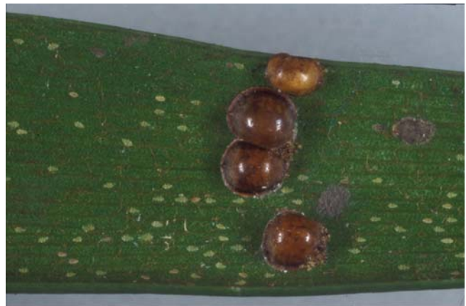
Figure 6. Hemispherical scale on coontie.

to 1/2 inch in diameter and may be nearly flat to almost spherical in shape. Because soft scales consume so much plant sap, they excrete a lot of sugary liquid, called honeydew.