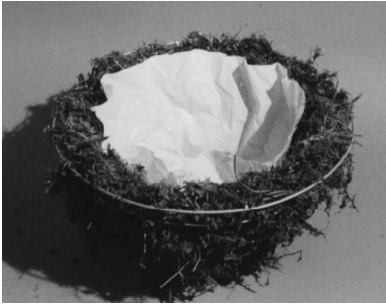
Figure 2. Place a layer of plastic or foil next to the moss before filling the basket with soil.