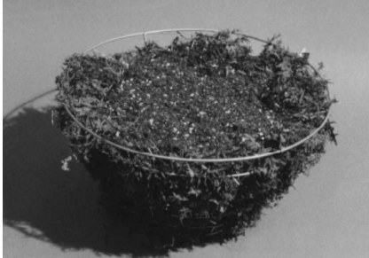
Figure 3. Fill the basket with a potting mix within 1/2-inch of the rim.