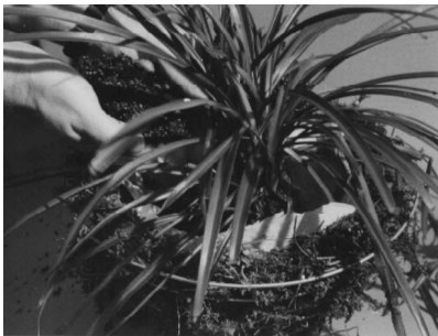
Figure 4. Plant the desired plant.

Water, fertilize and groom the plant(s) as needed to keep them healthy and growing. Hanging baskets may need to be watered every day during warm, dry weather. If flowering plants are used, remove dead blooms and seeds to promote more flowers. Protect cold-tender plants from freezing, winter temperatures by moving them indoors. Most plants eventually outgrow a hanging basket and will need to be repotted into a larger container.