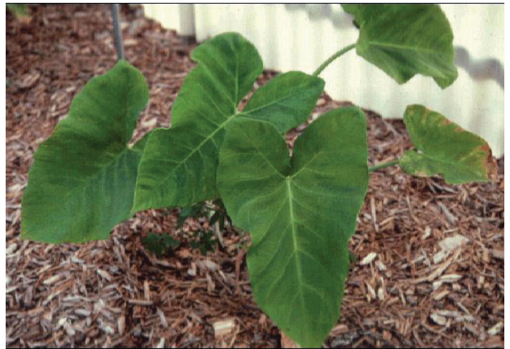
Figure 1. Malanga plant.

Malanga is widely grown and used in the tropics. In South Florida, it has been grown in small patches for many years, and on a limited commercial sale since 1963 to meet the demands of Latin Americans living here. There were about 2,500 acres of malanga grown in Dade County, Florida, in 1985. Malanga, along with calabaza and boniato, made up most of the 14,000 acres of tropical vegetables grown in Dade County in 1991.