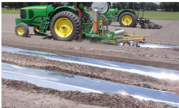
Figure 2. Methyl bromide application.