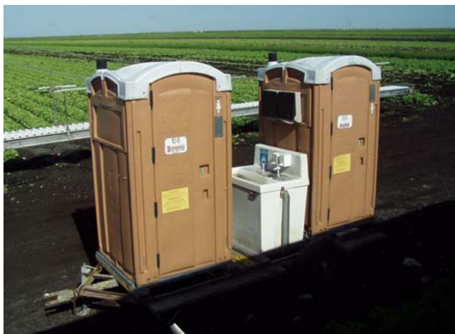
Figure 8. Portable decontamination site that can be transported.

site where workers and handlers are present (Figure 8) Many establishments make portable kits containing the decontamination supplies and keep them on the equipment or vehicle that is near or used by workers (Figure 9). Decontamination supplies should be provided to workers entering treating areas until 30 days following the REI's expiration and they should also be provided for early entry workers during and after early entry. More detailed information is contained in UF/IFAS EDIS Document PI-116, Worker Protection Standard: Decontamination Supplies http://edis.ifas.ufl.edu/PI153 .