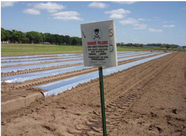
Figure 12. Posting sign for a fumigant application.

use sign should be posted (Figure 12). With most pesticides, however, only an oral warning is required. If posting signs are used, the inspector will ask when the signs were put into place and taken down. The WPS requires that signs for posting applications should be put in place 24 hours prior to the application and taken down within 3 days after the end of the REI. Failing to remove the signs is a common mistake. If an inspector notices workers in an area that is posted, they will assume that the workers are in an area that has been treated and is within an REI. Therefore, it is important to remove the signs as soon as the REI expires if workers will be within the site. More detailed information is contained in UF/IFAS EDIS Document PI-107, Worker Protection Standard: Notice about Applications http://edis.ifas.ufl.edu/PI144 .