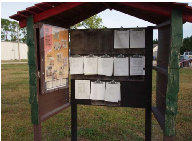
Figure 6. Example of a central information display.

posting are designated by a “W” on the form listed in page 10. As with the restricted use record, there is no required format for the form so long as the necessary elements are present. An example of a central information display is provided (Figure 6). More detailed information is contained in UF/IFAS EDIS Document PI-112, Worker Protection Standard: Information at a Central Location http://edis.ifas.ufl.edu/PI149 .