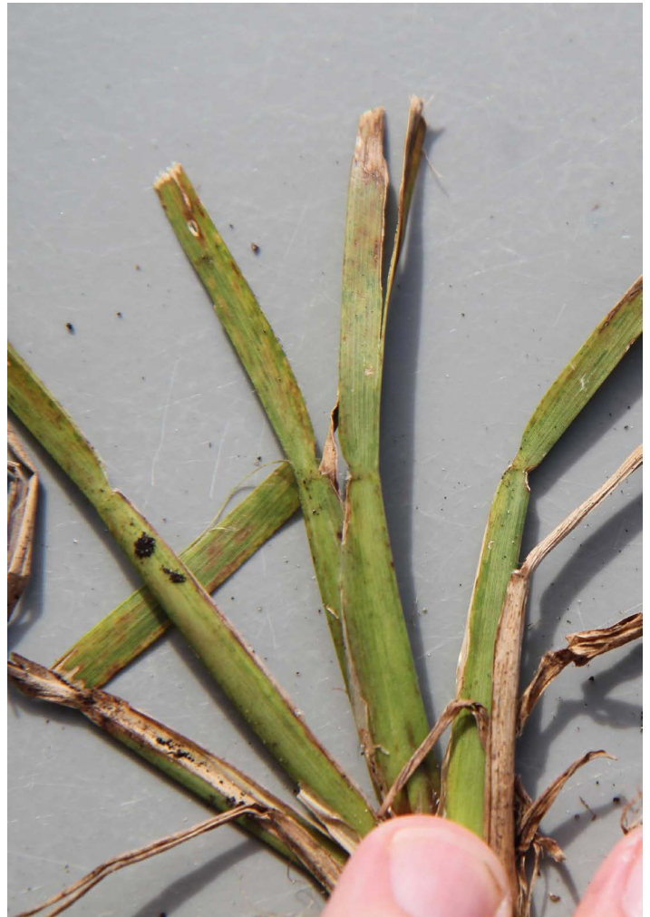
Figure 2. Severe mosaic and necrosis symptoms on St. Augustinegrass infected with Sugarcane Mosaic Virus.

Plant host resistance is the best management tool for viral diseases. The most severe symptoms in this recent epidemic have been observed on 'Floratam' St. Augustinegrass. 'Floratam' sod used to replace lawns that died from mosaic in 2013 has died again in 2014 in many cases. 'Palmetto' and 'Bitterblue' may get the disease but are more resistant. There are additional considerations and challenges with these cultivars (see http://edis.ifas.ufl.edu/lh010 ). The susceptibility of most other varieties is currently unknown. The virus has been reported to infect grasses in Cynodon