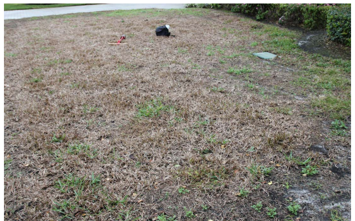
Figure 3. Mosaic disease caused by Sugarcane Mosaic Virus killed this St. Augustinegrass Lawn in Pinellas County, Florida.