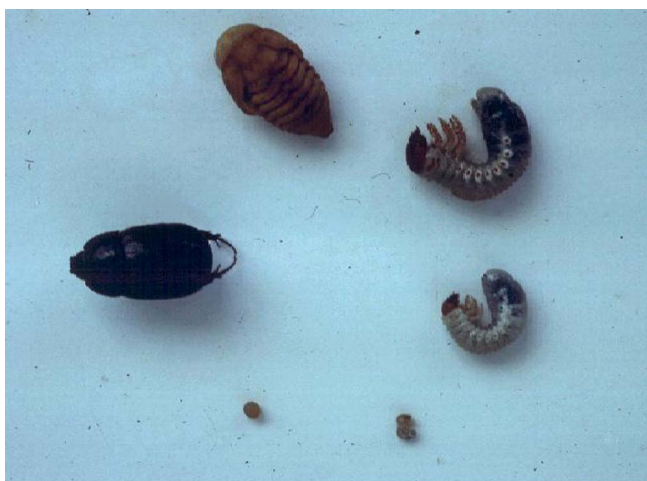
Figure 2. From 7 o'clock counterclockwise are the egg, first instar larva, second instar larva, third instar larva, pupa, and adult of Tomarus subtropicus .

yellowing (chlorosis) of the leaves. This is usually followed by stunted growth, dense browning, lodging, plant uprooting, and death in heavily infested areas. Symptoms may be seen as early as September. Damage is usually more severe in ratoon crops and is most evident around the edges of a field. Grub damage is also worse on muck soils than sandier soils.