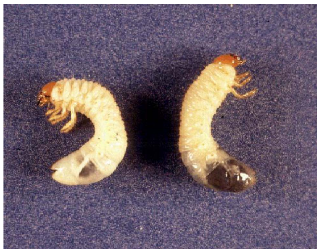
Figure 3. White grub ( Cyclocephala parallela ) infected with milky disease (left; note whitish tip of abdomen) and healthy grub (right).

in controlling grub populations is not known. Laboratory studies have shown C. parallela is more prone to infection than L. subtropicus .