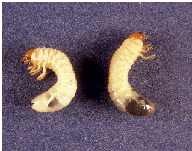
Figure 3. White grub infected with milky disease (left; note whitish tip of abdomen) and healthy grub (right).

Laboratory studies have shown C. parallela is more prone to infection than L. subtropicus .