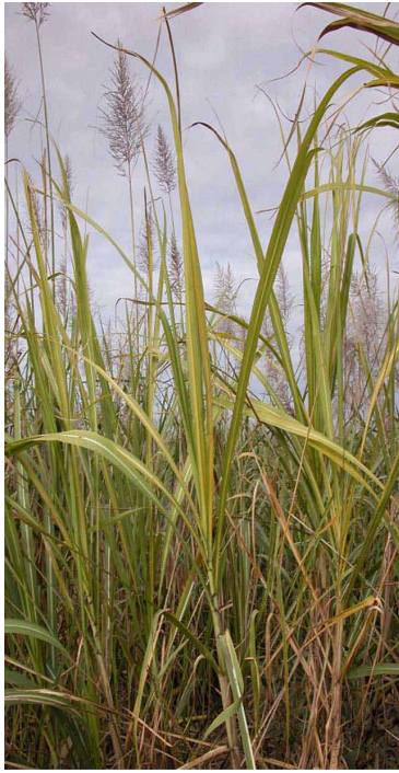
Figure 2. More general leaf yellowing is shown on mature sugarcane plants.

family that contains barley yellow dwarf virus, soybean dwarf virus, potato leaf roll virus, and pea enation mosaic virus-1. Its classification within the family has not been fully resolved. The virus is transmitted by aphids, Melanaphis sacchari and Rhopalosiphum maidis , in a semi-persistent manner. The virus is also spread by planting infected seedcane. The virus is localized within the phloem cells of the plant and can be diagnosed by either reverse transcription-polymerase chain reaction (RT-PCR) or tissue blot immunoassays using an antibody specific for the virus (Figure 3). There is no thermal treatment effective for eliminating SCYLV in infected sugarcane.