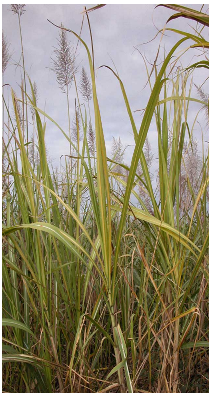
Figure 2. More general leaf yellowing is shown on mature sugarcane plants.