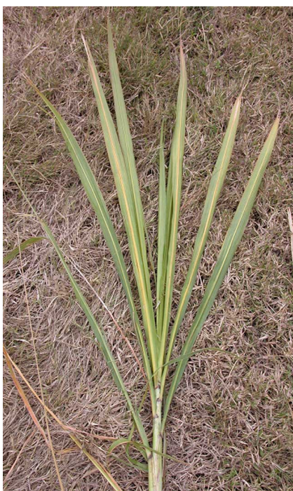
Figure 1. Initial symptoms of yellow leaf, with a yellowing of the lower surface of the leaf midrib of leaves 3 to 6 counting from the top expanding spindle leaf.