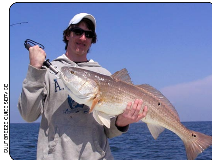
GULF BREEZE GUIDE SERVICE

BogaGrips® are commonly used in handling fish, but not always properly. Maintain a good hold on the fish's lower jaw with the tool in one hand, and cradle the belly of the fish with your other hand. This maintains control of the fish and keeps it in a horizontal position. Holding the fish vertically will tear mouth and jaw cartilage, and displace its organs, causing internal damage.