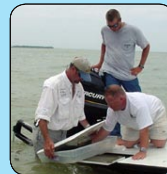
Fishermen should transport fish using shallow plastic fish boxes.

regularly and responds to external stimulus such as a hand waved over the tank.