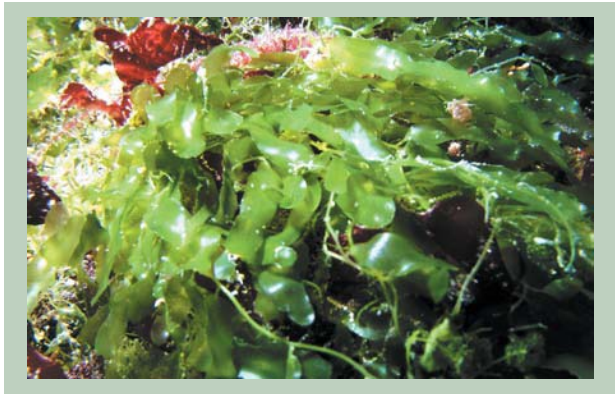
Caulerpa brachypus (Geoff Oldfather)

In May 2001, HBOI scientists funded by Florida's Harmful Algal Bloom Task Force were surveying algae throughout Palm Beach and northern Broward counties. On the first dive off Singer Island, they discovered extensive blooms of the green alga Caulerpa brachypus at a depth of 43 meters (141 feet). C. brachypus is not native to Florida's east coast. It is a native of the Pacific Ocean rather than the Atlantic.