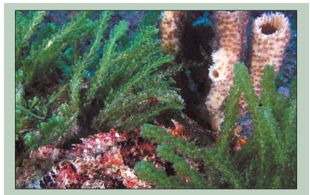
Caulerpa racemosa (Lazaro Ruda)

Another larger, native, green alga, Caulerpa racemosa , also became increasingly conspicuous and abundant during the late 1990s. Unlike Codium , Caulerpa does not rely entirely on nutrients in the water column for growth. It can draw nutrients from sediments through its root-like stolons and rhizoids.