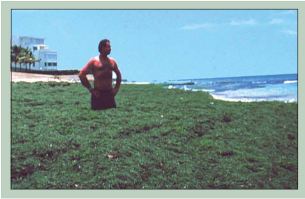
Codium isthmocladum