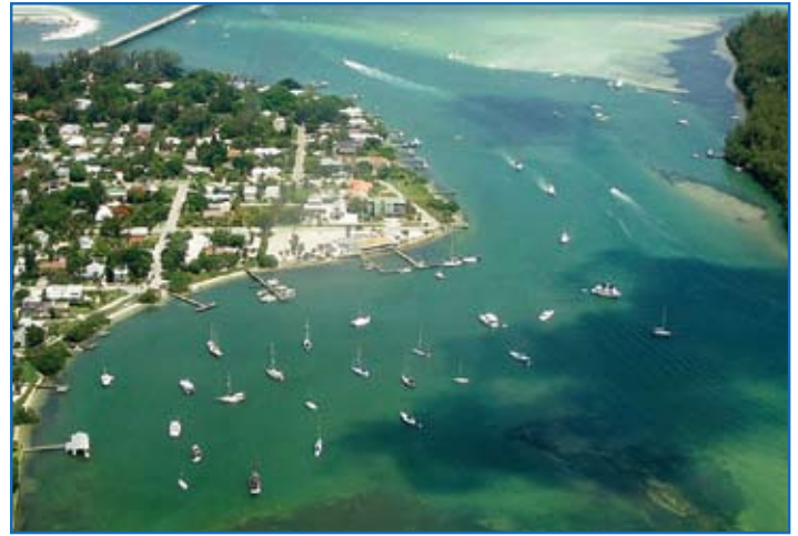
The popular anchorage near Longboat Pass is one of many busy boater destinations in southwest Florida.

The process provides a comprehensive overview of channel conditions, and the geographic distribution and severity of impediments to safe navigation and resource protection. It also supports more efficient permitting and saves tax dollars. Compared with traditional approaches to waterway management, the science-based regional waterway management system is unbiased, transparent, ecologically sound and fiscally prudent.