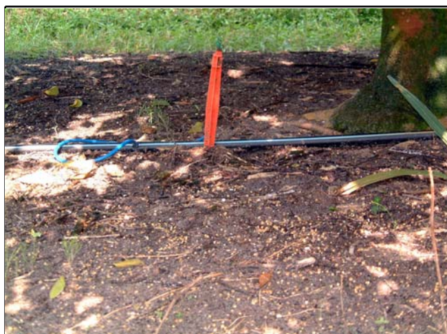
Figure 2. Fertilizer remains under the tree canopy following several heavy rain events during the first two months after application.

Yield response to water-soluble N fertilizer was described by a gently-sloping curve that reached its maximum at 77 pounds solids/tree (Fig. 3). Description of the N rate response for CRFs was limited because the resin and Poly-S coated sources were applied at only two rates and the mixture was applied at only one rate. Still, the increased N fertilizer efficiency provided by the controlled-release sources was evident by the sharp increase in yield as N rate increased from 45 to 90 lbs/acre (Fig. 3). It was apparent that the citrus trees responded more strongly to increasing rates of CRF compared with the water-soluble source.