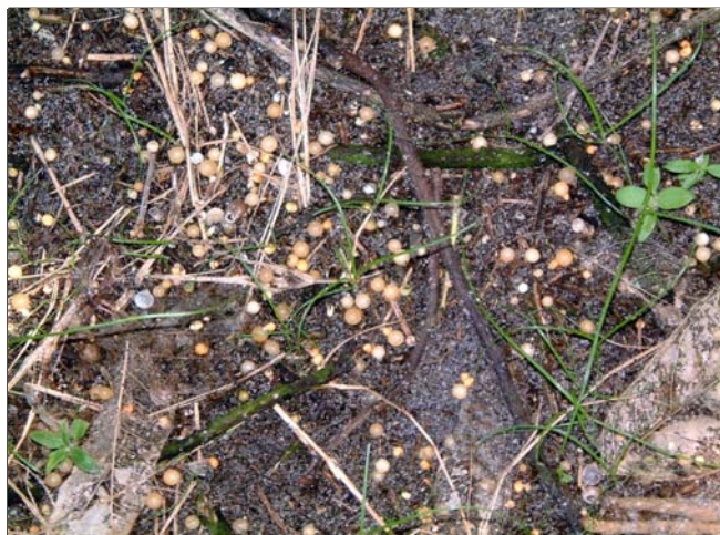
Figure 1. Fertilizer shown under the tree canopy following mechanical application.

together and expressed production as “5-year cumulative pounds solids per tree.”