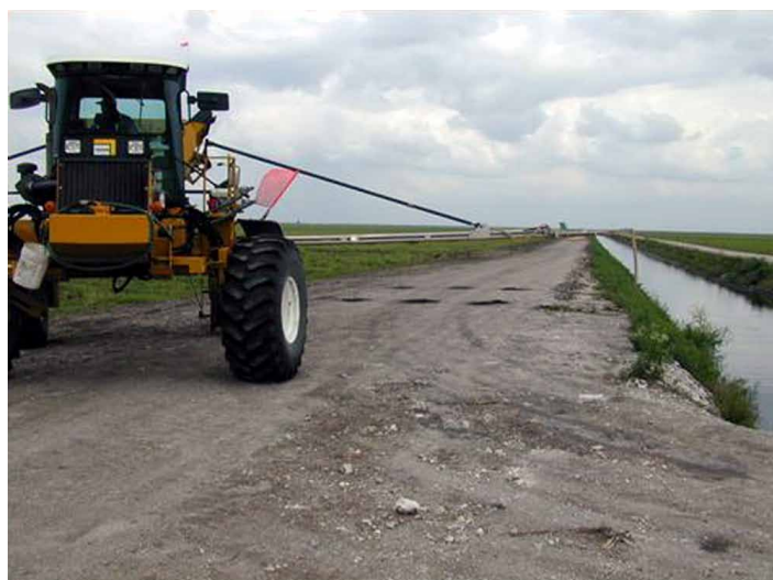
Figure 5. Reduce speeds when turning to avoid misapplication to roads, canals, and ditches.