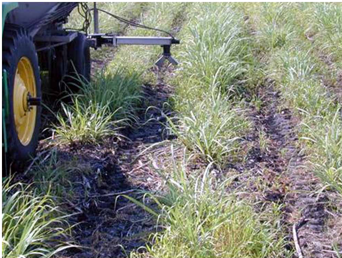
Figure 1. Band application of P fertilizer increases P use efficiency by the crop.