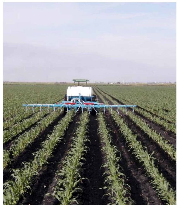
Figure 3. Banding reduces application rates and the likelihood of re-application to the same row.