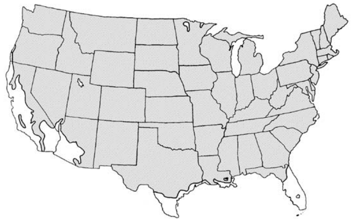
Figure 2. Range

Availability: somewhat available, may have to go out of the region to find the tree