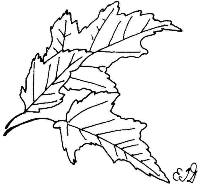
Figure 3. Foliage

Pest resistance: resistant to pests/diseases