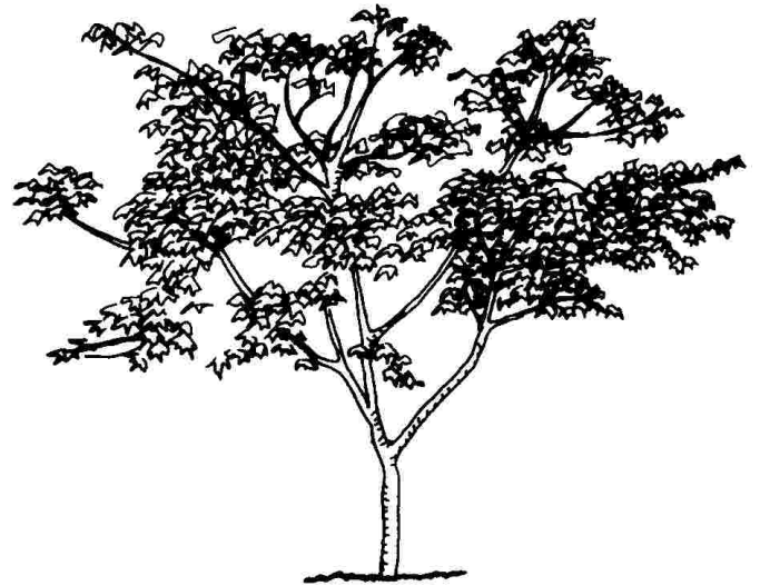
Figure 1. Young Acer japonicum 'Acontifolium': 'Acontifolium' Fullmoon Maple

Full-Moon Maple is a small, deciduous tree which reaches 10 to 15 feet in height and width, creating an irregular, rounded silhouette. It fits well into the oriental garden due to the exotic silhouette. This cultivar is exceptionally cold hardy, having survived temperatures of 25 degrees below zero. The deeply divided, soft green leaves have 9 to 11 lobes and are delicately displayed on thin, drooping branches. Leaves take on a beautiful yellow to red coloration in the fall before dropping, making this small, dense plant really stand out in the landscape. Fall color has been described as exceptional. The hanging clusters of purple/red flowers appear in late spring and are followed by the production of winged seeds.