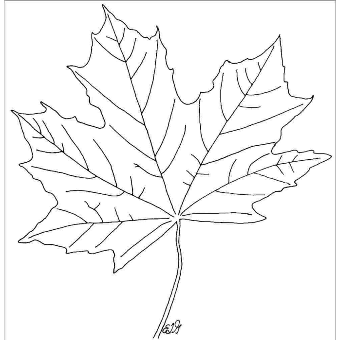
Figure 3. Foliage

Pest resistance: resistant to pests/diseases