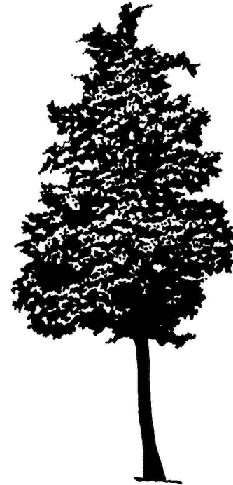
Figure 1. Mature Alnus glutinosa : Common Alder

USDA hardiness zones: 3A through 7B (Fig. 2)