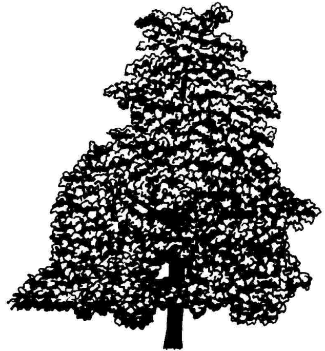
Figure 1. Middle-aged Catalpa spp. : Catalpa

Uses: urban tolerant; reclamation; shade