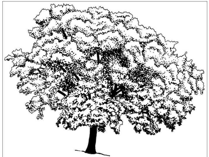
Figure 1. Mature Celtis occidentalis 'Prairie Pride': 'Prairie Pride' Common Hackberry