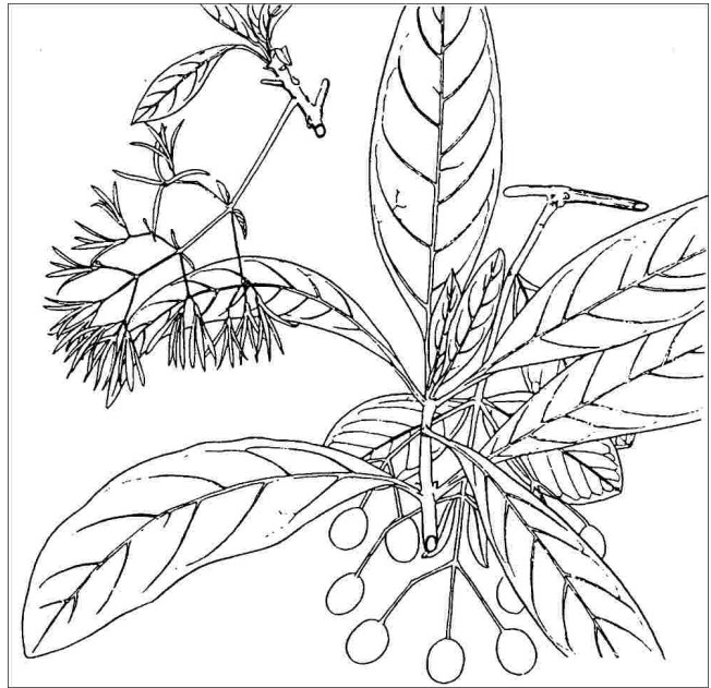
Figure 3. Foliage

Dark green, glossy leaves emerge later in the spring than those of most plants just as the flowers are at peak bloom. This differs from Chinese Fringetree which flowers at the terminal end of the spring growth flush. Female plants develop purple-blue fruits which are highly prized by many birds. Fall color is yellow in northern climates, but is an unnoticed brown in the south, with many leaves dropping to the ground a blackened green. The flowers can be forced into early bloom indoors.