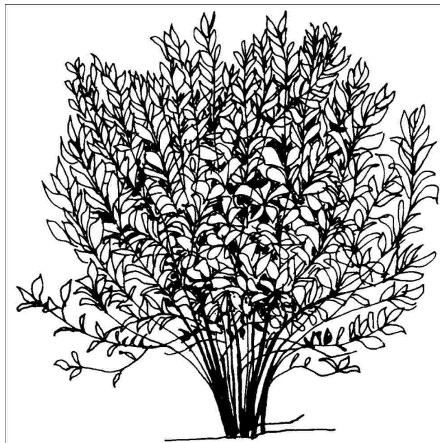
Figure 1. Middle-aged Chionanthus virginicus : Fringetree

Invasive potential: little invasive potential