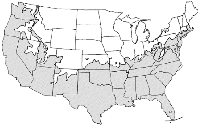
Figure 2. Range