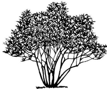
Figure 1. Middle-aged Diospyros texana : Texas Persimmon