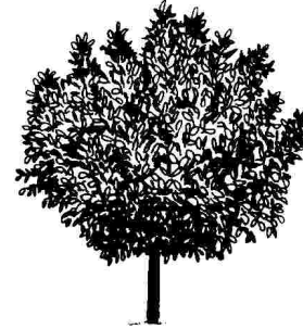
Figure 1. Middle-aged Fraxinus pennsylvanica : Green Ash

Pronunciation: FRACK-sih-nus pen-sill-VAN-ih-kuh