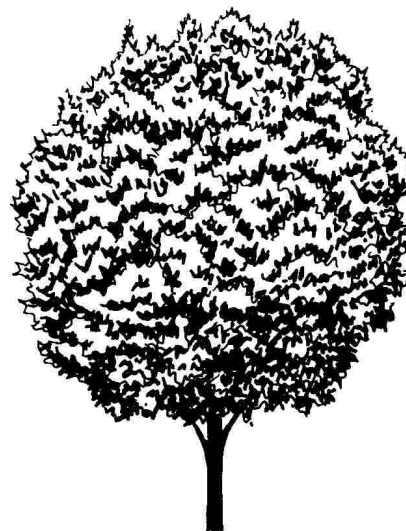
Figure 1. Middle-aged Fraxinus pennsylvanica 'Summit': 'Summit' Green Ash

'Summit' Green Ash grows into a pyramidal form when young, maturing to a rather open, oval silhouette 55 feet tall by 50 feet wide. Once developed properly in the nursery, the trunk remains straight up through the crown of the tree and the branch habit is reported to be better than the species. Early pruning helps assure that this happens. The trees grow quickly and can sometimes reach 80 feet in height. Green to reddish-purple flowers appear in spring but do not produce fruit since the plant is supposedly a male. But some horticulturists believe that there are female trees mixed with the population. If the tree truly is a male, this could make this a superior replacement for the once very popular 'Marshall Seedless' which has some female trees mixed with the population and now some trees are fruiting. 'Marshall Seedless' is also reportedly susceptible to storm damage, although some of this could be due to improper or no pruning. Unlike other Green Ashes which have unpredictable fall color, 'Summit' displays foliage of an intense golden-yellow. The attractive bark is red-tinged and furrowed and reportedly thicker than other Ashes.