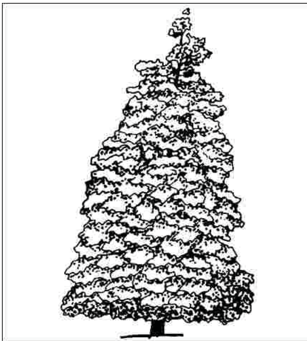
Figure 1. Middle-aged Ilex opaca : American Holly

A popular landscape plant since the beginning of American history, this broad-leaved evergreen has served a variety of uses through the years (Fig. 1). The American Indians used preserved Holly berries as decorative buttons and were much sought after by other tribes who bartered for them. The wood has been used for making canes, scroll work and furniture, and has even been substituted for ebony in inlay work when stained black.