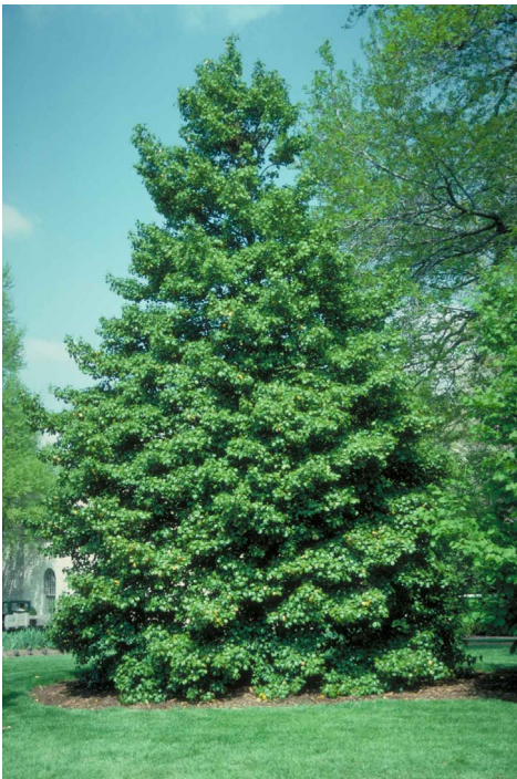
Figure 1. Middle-aged Ilex opaca : American Holly

A popular landscape plant since the beginning of American history, this broad-leaved evergreen has served a variety of uses through the years (Fig. 1). The American Indians used preserved Holly berries as decorative buttons and were much sought after by other tribes who bartered for them. The wood has been used for making canes, scroll work and furniture, and has even been substituted for ebony in inlay work when stained black.