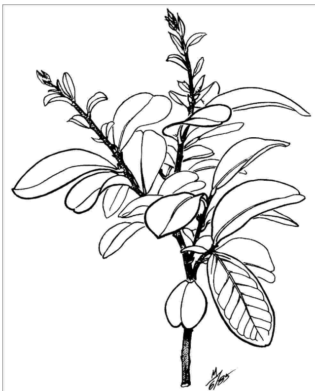
Figure 3. Foliage

The 6- to 12-inch-long clustered lavender or pink blooms appear on the tips of branches during late spring and summer in USDA hardiness zones 9 and 10 and summer in other areas. The individual flowers are ruffled and crinkly as to appear made of crepe paper. The smooth, peeling bark and multi-branched, open habit of Crape-Myrtle make it ideal for specimen planting where its bright red to