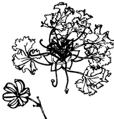
Figure 4. Flower

orange-colored fall leaves add further interest. The tree forms an upright to upright-spreading crown, the branches spreading out as they ascend. The tree grows 20 to 25 feet tall and almost as wide with an upright, vase-shaped crown making it well-suited for street tree planting.