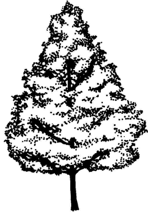
Figure 1. Young Liquidambar styraciflua 'Festival': 'Festival' Sweetgum

Uses: tree lawn > 6 ft wide; shade; street without sidewalk; specimen; reclamation; highway median; parking lot island > 200 sq ft